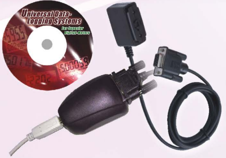
BRUA-85Xa Interface Kit (optional purchase)